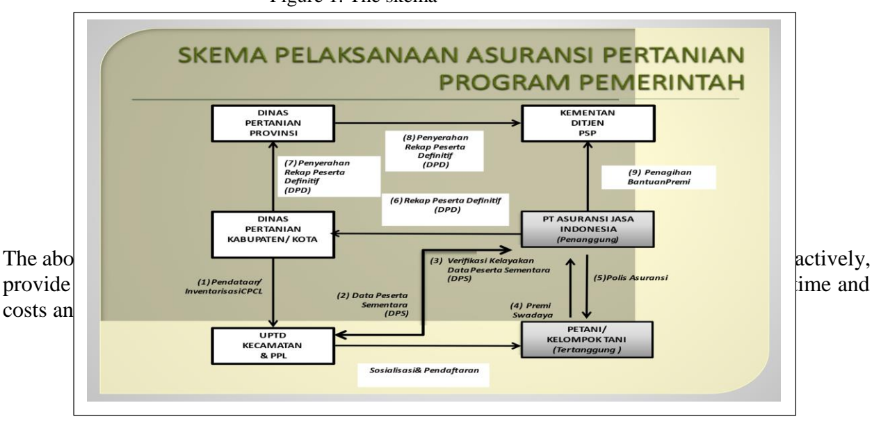
Figure 1. The skema

The technical challenges faced are related to the assessment of risk exposure in the agricultural sector and how to design the risk model to determine the maximum loss. These two key things enable the government to develop adequate agricultural risk management policies. Various measures to control the accumulation of appropriate agricultural risks should be addressed if the aim is to expand agricultural insurance for agricultural activities with high risk exposures such as high value crops, fish farming and plantations. Appropriate assessment of agricultural production risk and design of actuarially reasonable agricultural insurance products depend on the availability of agricultural production data, mapping of risk areas and weather data. In this regard, should the government invest in better weather and agricultural information infrastructure and services, for example by compiling a national database and making this database available to all interested private commercial insurance companies, either free of charge or at a certain rate. In addition, does the government need to play an important role in raising awareness of farmers, holding capacity building workshops and technical training programs for staff of insurance companies.