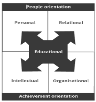
Figure 2. Dimension of the ability of headmasters

An effective headmaster have a wide range of abilities. Scheme of Duignan (2003; 2004) identified five basic capabilities of the headmaster that are interdependent and related in nature as shown in Figure 2. These five capabilities include: (1) educational capabilities which is the main ability in maintaining the focus of the headmaster's attention to the teaching and learning process. Meanwhile, (2) personal capabilities and (3) relational capabilities underlied the headmaster's leadership orientation towards the important role of the people around (people orientation) (educators, education staffs, learners, and stakeholders). On the other hand, (4) intellectual capabilities and (5) organizational capabilities underlied the form of achievement orientation (effectiveness, efficiency of the process, learning outcomes and environment) towards the performance of headmaster.